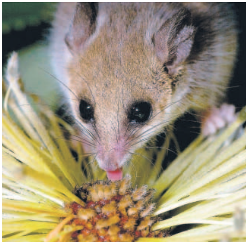
◀ Hello, possum: the western pygmy possum is a small nocturnal marsupial.